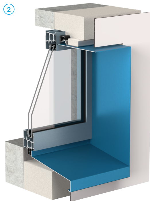
Application on ventilated facade