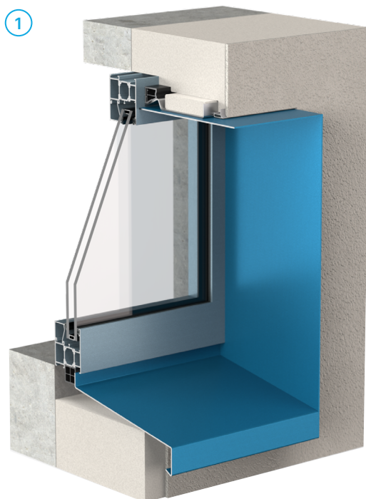
Application on plastered facade